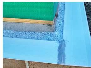
Termiglass in the brick cavity.